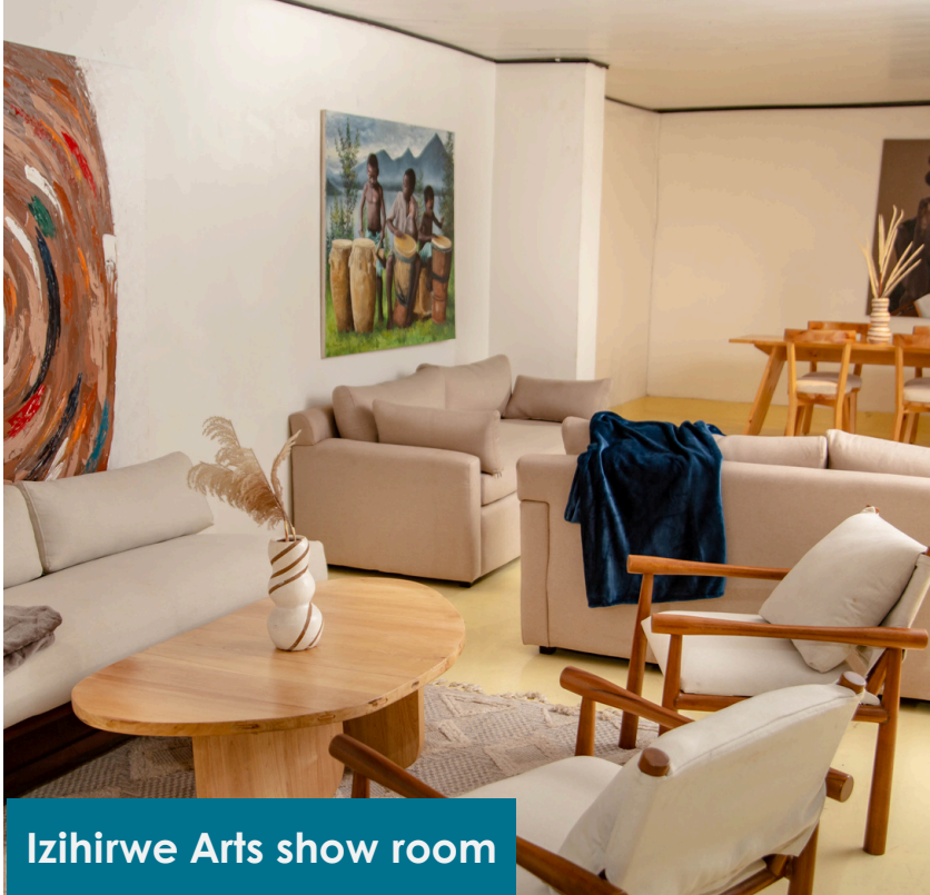
Izihirwe Arts show room